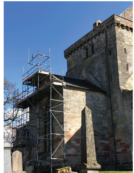
North Transept works