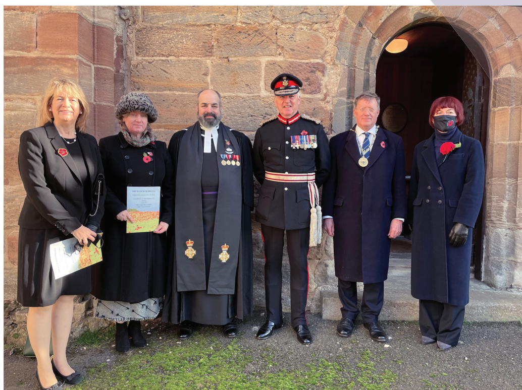
Service of Remembrance 2021