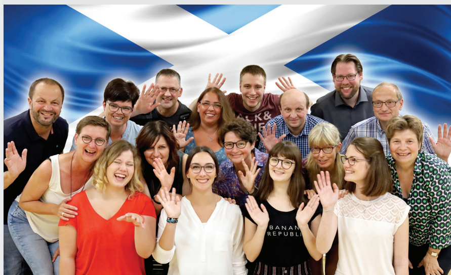
Junger Chor Hünshoven